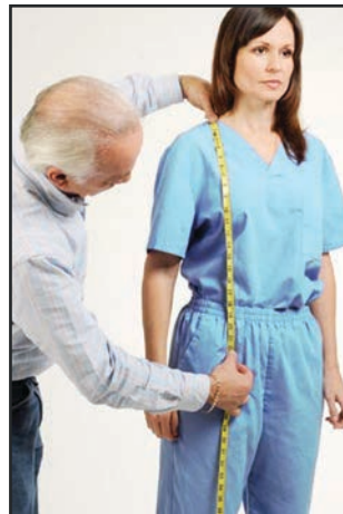
VEST LENGTH MEASUREMENT

Measure from the top of the shoulder over the bust to the desired length. Do not contour the tape measure under the bust.