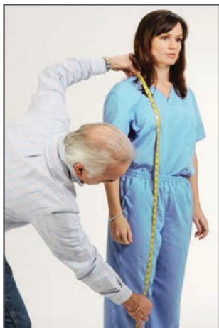
FRONT APRON LENGTH MEASUREMENT

Measure from the top of the shoulder over the bust to the desired length. Do not contour the tape measure in under the bust.